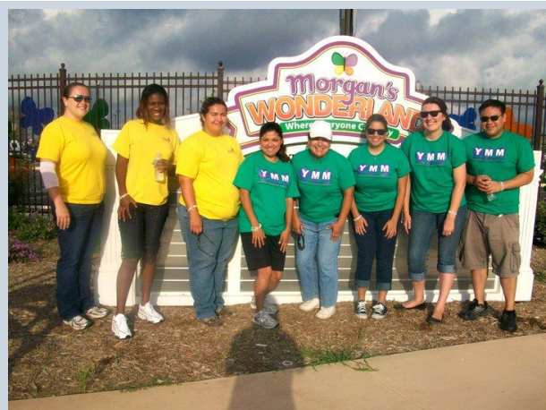
The Health Collaborative team poses at Morgan's Wonderland's Race for Inclusion.