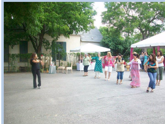
Girls in the Garden attendees participate in Zumba with Reshape to Live .