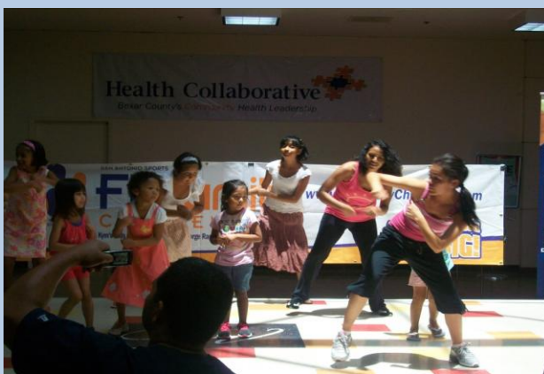
Zumba at Fit Fest!